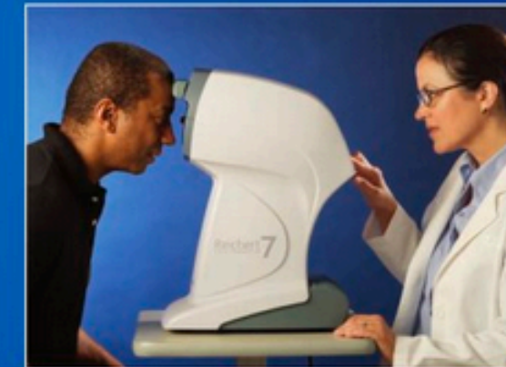
No joystick, chinrest or elevation controls necessary 1