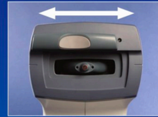
Headrest enables easy patient positioning